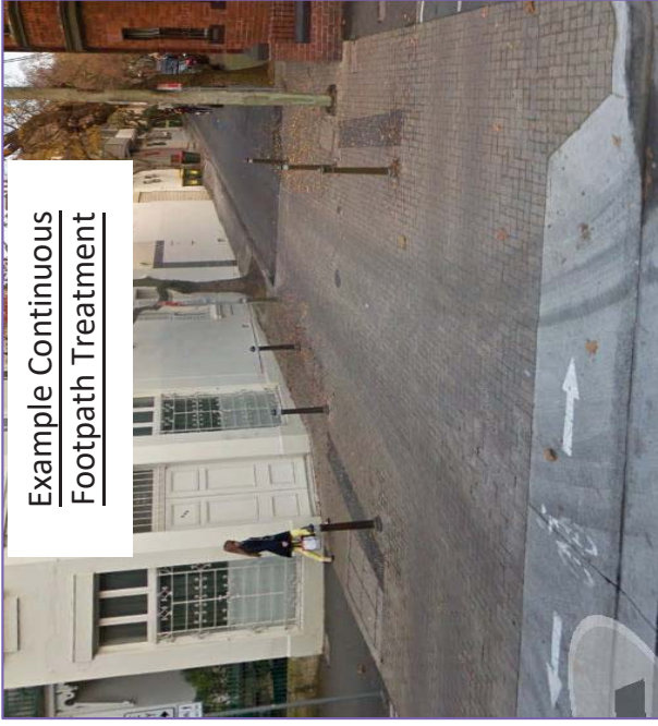
Example Continuous Footpath Treatment